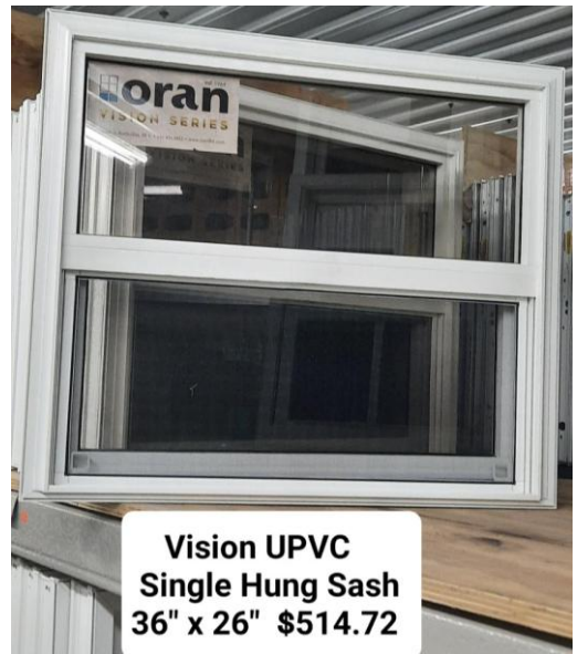
VISION UPVC SINGLE HUNG SASH WINDOWS OX WH/BR TINT