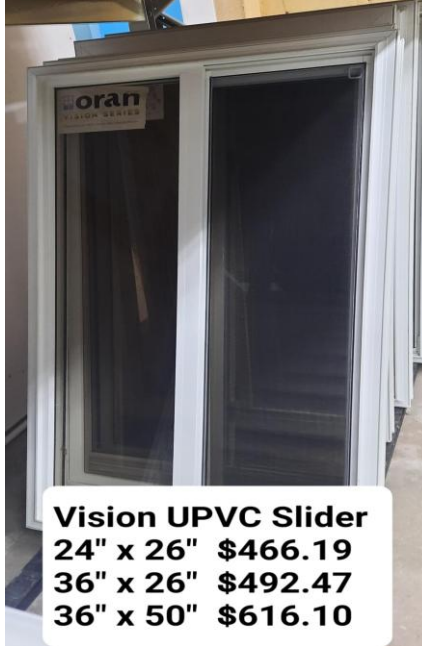
VISION UPVC HS SLIDING WINDOWS OX WH/BR TINT